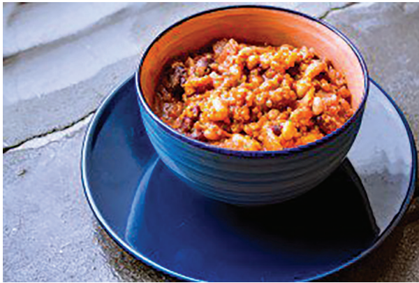
Quinoa Pumpkin Chili by All About Vegan Food.

The most common misconception out there is that you have to consume meat in order to get enough protein. This is simply not true. There may be protein in meat, but that doesn't mean that it doesn't exist anywhere else. In fact, vegans simply do what cows, pigs, sheep and chickens do; we go to the source.