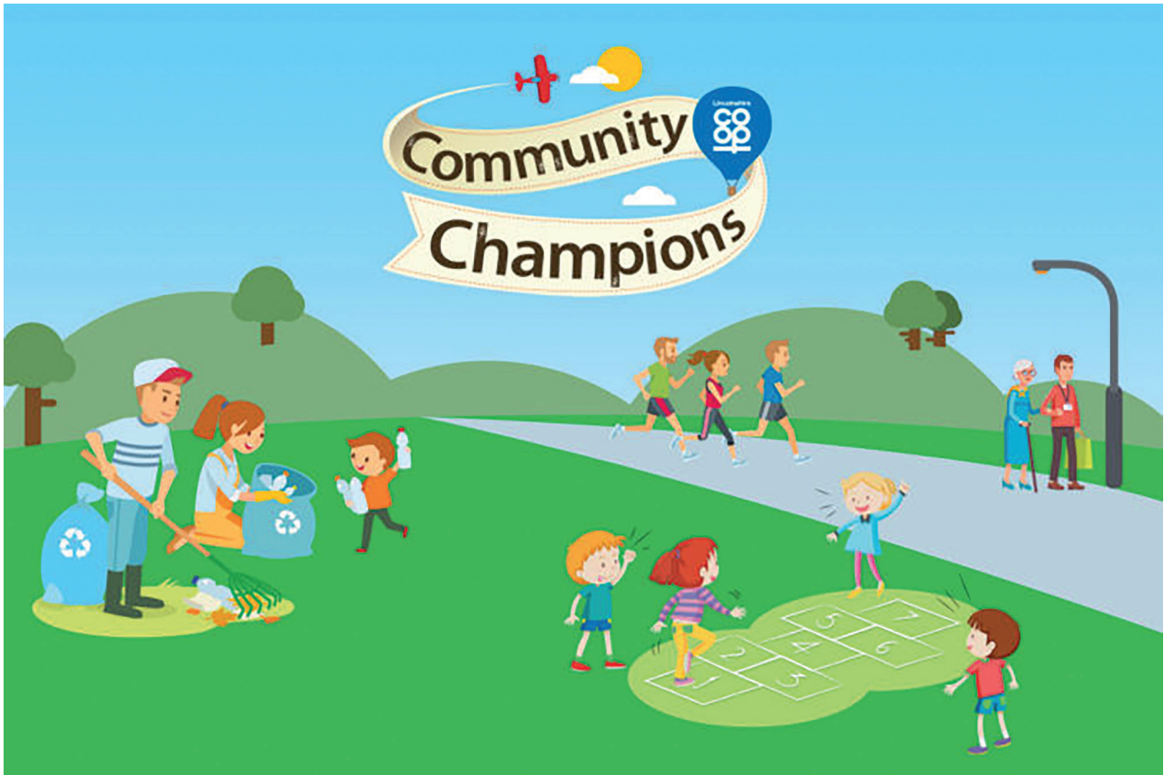
Fig. 1 Advertisement for the Lincolnshire Co-op Community Champions scheme.

Since the Community Champions scheme launched in 2013, we've helped a wide range of local groups and charities to make life better in their communities.