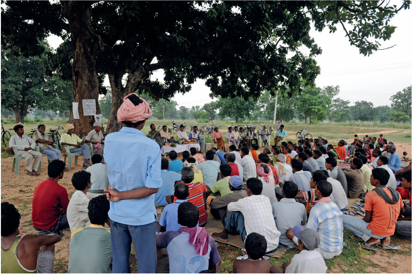
Fig. 3 Villagers in Jharkhand, India, being addressed by NGO workers about their land rights.