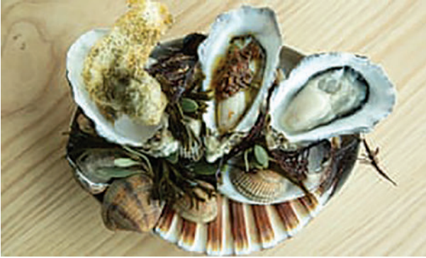
‘With a deep, rich rust sauce’: rock oysters.

Taxis can drop off, though it’s still a walk from the road. Otherwise, it’s a major yomp uphill because there’s no parking. No one would describe it as a model of accessibility. On a beautiful Edinburgh summer’s day when the sun barely bothers to set, this could be joyous. I go on a late November day, when half the North Sea is being deposited on the hilltop. I feel intrepid simply for getting to the door.