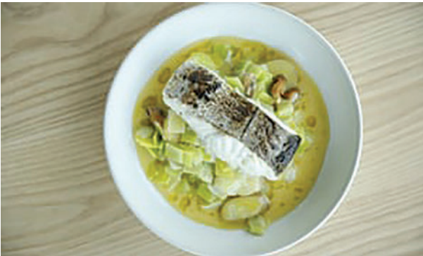
‘In a puddle of buttery broth bringing it all together’: hake, mussels and leeks.

That is the case for the prosecution. Here then is the defence: at lunchtime, when it’s a short à la carte, the Lookout is worth busting your lungs for. The view is spectacular, even when the cloud-base is descending on the city like a duvet being chucked over a bed, but you won’t look up much because the food is so diverting. It is simple ideas, well executed, using great ingredients in the service of big flavours.